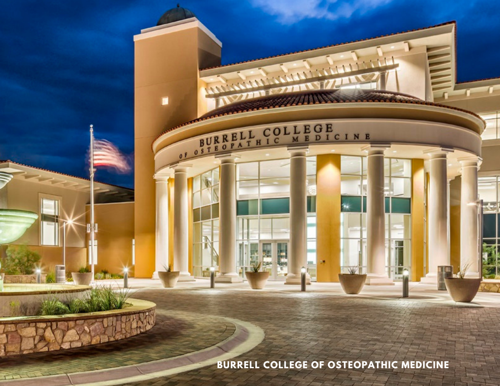
BURRELL COLLEGE OF OSTEOPATHIC MEDICINE